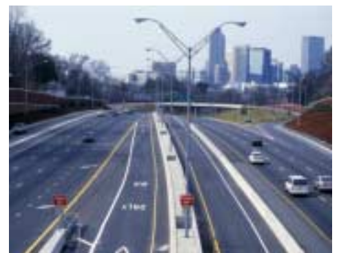
HOV Lanes - Charlotte