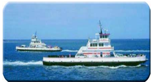
NC Ferry Service- Outer Banks