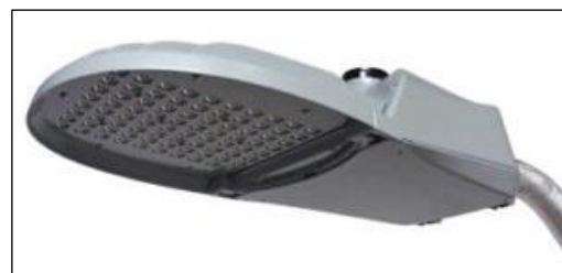
Bottom view of GreenCobra® streetlight with grey finish

LeoTek® Electronics Light-On Group manufactures the GreenCobra® line of LED streetlights in the US. The GC1-80F model is listed on the Approved Products List (APL) as NP19-8484, and the GC2-96G model is listed as NP19-8485. Both products are intended to serve as replacements for older High-Pressure Sodium (HPS) lighting, or as new lighting installations. The GC1-80F has a HPS replacement equivalent wattage range of 200 – 310 and has a maximum output of 17,700 lumens. While the GC2-96G has a HPS replacement equivalent wattage range between 310 – 400 with a maximum output of 35,800 lumens. Both products are available with various finish colors, wiring, and power options. They both have a 10-year, 100,000-hour warranty, and are International Dark Sky Association listed. For more information, please visit: www.leotek.com