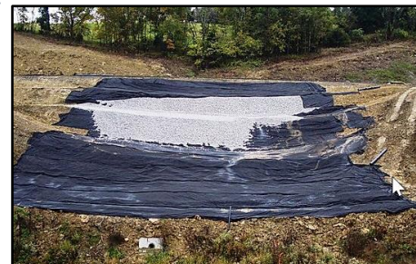
Installation of geotextile fabric for soil separation and stabilization

Foundation Geotextiles has been extruding and weaving polypropylene yarns and designing geotextile products for over 40 at their manufacturing facility in Clarkesville, GA. The Foundation Geotextiles (FG27) product is approved as a NCDOT Type 5 Geotextile and is listed on the APL as NP19-8481. Foundation Geotextiles also has FG57 listed on the APL as an approved Pavement Stabilization Geotextile (NP19-8482). Both products are manufactured from high-tenacity polypropylene yarns, which are woven into a dimensionally stable network in such a manner that the yarns retain their relative position to one another. FG27 and FG57 both resist ultraviolet deterioration and biological degradation and is inert to most naturally encountered soil chemicals, alkalis, and acids. Both fabrics are National Transportation Product Evaluation Program (NTPEP) certified, and are produced in a standard roll of 15 x 300 ft. For more information, please visit: www.foundationgt.com/