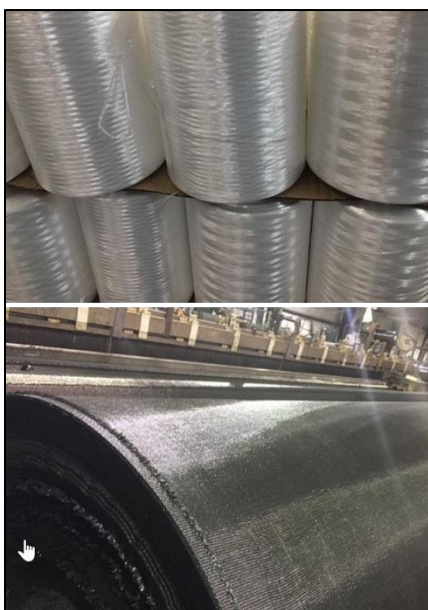
Spooled polypropylene yarns before manufacturing (top), geotextile product after weaving (bottom)

Foundation Geotextiles has been extruding and weaving polypropylene yarns and designing geotextile products for over 40 at their manufacturing facility in Clarkesville, GA. The Foundation Geotextiles (FG27) product is approved as a NCDOT Type 5 Geotextile and is listed on the APL as NP19-8481. Foundation Geotextiles also has FG57 listed on the APL as an approved Pavement Stabilization Geotextile (NP19-8482). Both products are manufactured from high-tenacity polypropylene yarns, which are woven into a dimensionally stable network in such a manner that the yarns retain their relative position to one another. FG27 and FG57 both resist ultraviolet deterioration and biological degradation and is inert to most naturally encountered soil chemicals, alkalis, and acids. Both fabrics are National Transportation Product Evaluation Program (NTPEP) certified, and are produced in a standard roll of 15 x 300 ft. For more information, please visit: www.foundationgt.com/