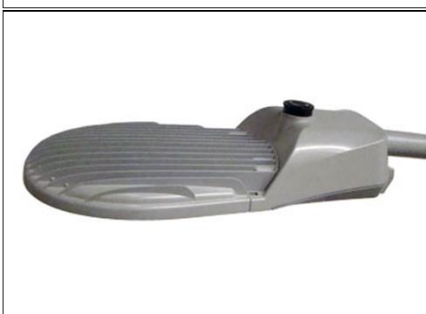
Side view of GreenCobra® streetlight with black finish (Top), top view of GreenCobra® streetlight with grey finish (Bottom) – images from LeoTek® website

LeoTek® Electronics Light-On Group manufactures the GreenCobra® line of LED streetlights in the US. The GC1-80F model is listed on the Approved Products List (APL) as NP19-8484, and the GC2-96G model is listed as NP19-8485. Both products are intended to serve as replacements for older High-Pressure Sodium (HPS) lighting, or as new lighting installations. The GC1-80F has a HPS replacement equivalent wattage range of 200 – 310 and has a maximum output of 17,700 lumens. While the GC2-96G has a HPS replacement equivalent wattage range between 310 – 400 with a maximum output of 35,800 lumens. Both products are available with various finish colors, wiring, and power options. They both have a 10-year, 100,000-hour warranty, and are International Dark Sky Association listed. For more information, please visit: www.leotek.com