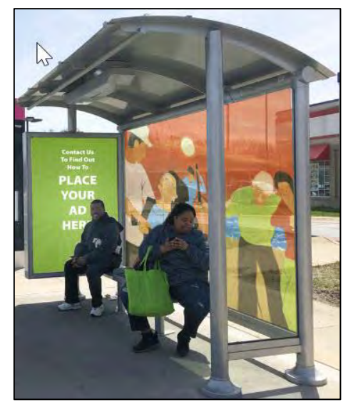
Example of Bus/Transit shelter with curved roof and advertising kiosk – image from Tolar website

Tolar Manufacturing Company, Inc. has several Transit and Bus Shelters listed on the APL. There are four shelters listed as approved for provisional use under their Niagara series line of products. The products are listed as NP15-7128, NP19-8398, NP19-8399, and NP20-8659. Tolar Manufacturing Company, Inc. designs and manufacturers their products in Corona, California. All the approved shelters are designed to withstand maximum winds of 150 MPH. All shelters include a variety of options; including various roof lines and styles to suit any streetscape, bus benches, trash receptacles, glass treatments and wall panels, illumination