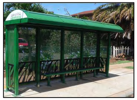
Example of a Bus/Transit shelter with dome roof

options including solar and low draw LEDs. Shelters are available with or without advertising/media display kiosks. For more information, please visit: <u>https://www.tolarmfg.com/</u>