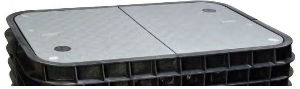
View of Bulk© Utility Vault with gray SHIELD™ Cover

The Bulk<sup>©</sup> Utility Vault / Junction Boxes with SHEILD<sup>TM</sup> Covers are currently Approved for Provisional Use for utility applications. They are listed on the Approved Products List as NP20-8960 and NP19-8584. They are manufactured by Channell Commercial Corporation in Rockwall, TX. While most Utility Vaults / Junction Boxes and their lids are composed of concrete or polymer concrete, these Utility Vault covers are composed of a cross-linked composite matrix of long strand glass fibers, polyester resin, proprietary organic minerals, gray color pigment and a UV inhibitor Package. This results in a significant weight reduction for these products, increasing the ease of installation and transportation without sacrificing strength. The SHEILD<sup>TM</sup> composite lids exceed Tier-22 compliance requirements and have undergone 10,000 hours of Zenon Arclamp testing to simulate 20 years of UV degradation. For more information, please visit: <a href="https://www.channell.com">www.channell.com</a>