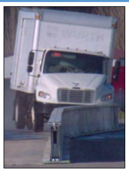
Example of a box truck colliding with, and being safely deflected by the HighwayGuard™ system

The HighwayGuard<sup>™</sup> and HighwayGuard LDS<sup>™</sup> (Lowest Deflection System) are temporary/portable steel barrier systems intended primarily for work zone applications. The product is currently under evaluation and is listed on the APL as NP20-8707. The HighwayGuard systems are both Manual for Assessing Safety Hardware (MASH) 2016 TL-3 and TL-4 compliant. Both systems utilize the same metal barrier sections, but with