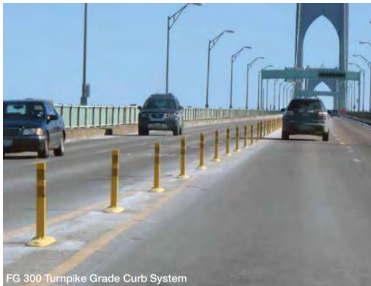
View of FG 300 Turnpike Grade Curb System

Pexco, LLC's FG 300 Turnpike Grade Curb System is a passive traffic control device consisting of modular raised curb sections and channelizer posts. These systems are designed to withstand multiple high-speed impacts in locations where pavement markings are insufficient - such as High Occupancy Vehicle (HOV) lanes and work zones. The polymer resin base can be attached to the roadway using bolts or an adhesive. The polyurethane post utilizes a unique clover leaf design that allows it to rebound to its normal upright position after an impact. The system is AASHTO MASH tested, NCHRP 350 compliant and approved by FHWA. FG 300 Turnpike Grade Curb System is currently Approved on the Approved Products List as NP20-8628.