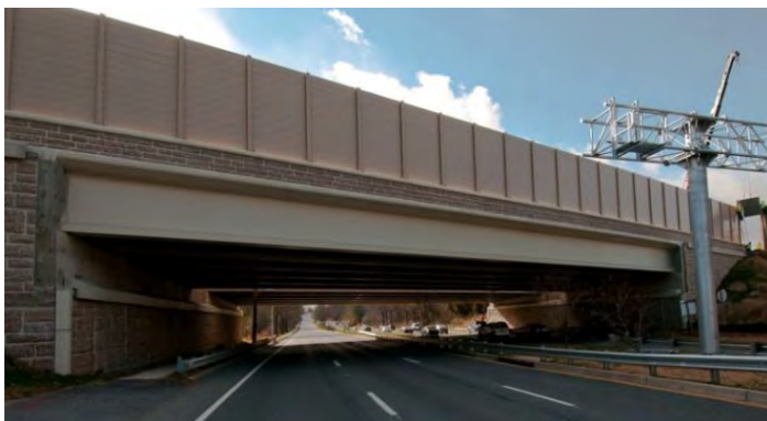
View of AcoustAL™ panels installed on a bridge

Faddis Concrete Products' AcoustAL™ Aluminum Noise Barrier is a lightweight absorptive noise panel made with a perforated aluminum shell filled with mineral wool. The aluminum shell is powder coated for increased durability and provides a wide variety of color options. Its lightweight design of 3.5 pounds per square foot is beneficial for structure mounting purposes such as bridges. The panels can span 8 to 10 feet for structure mounted applications or 12 feet for ground mounted applications. AcoustAL™ is currently listed as Approved for Provisional Use on the Approved Products List as NP20-8669. For more information, please visit: www.faddis.com/product/acoustal/ .