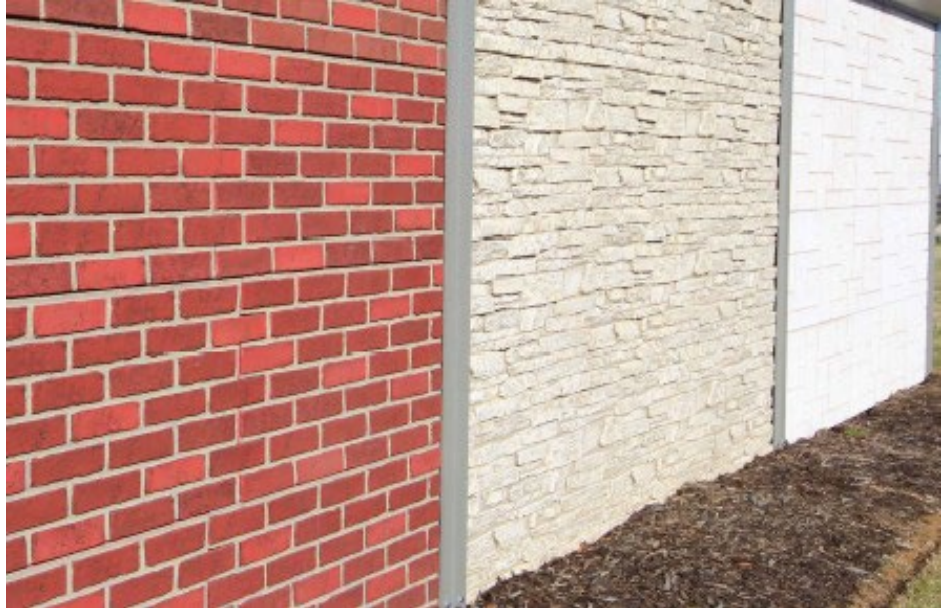
Image of various patterns the Aphrodite Sound Wall is capable of from VANQUISH Fencing Solution's product submittal document.

For more information, please visit http://vanquishfencing.com .