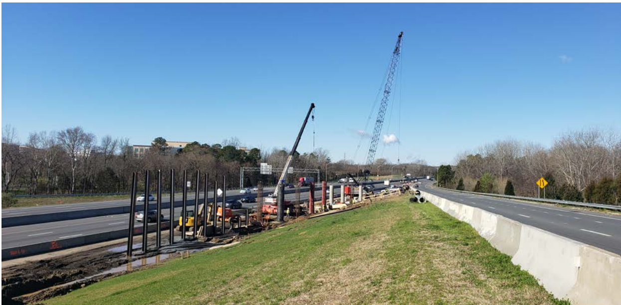
Johnston Road Direct Connect Bridge