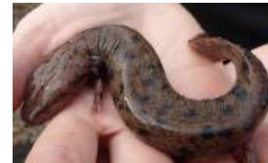
Neuse River Waterdog