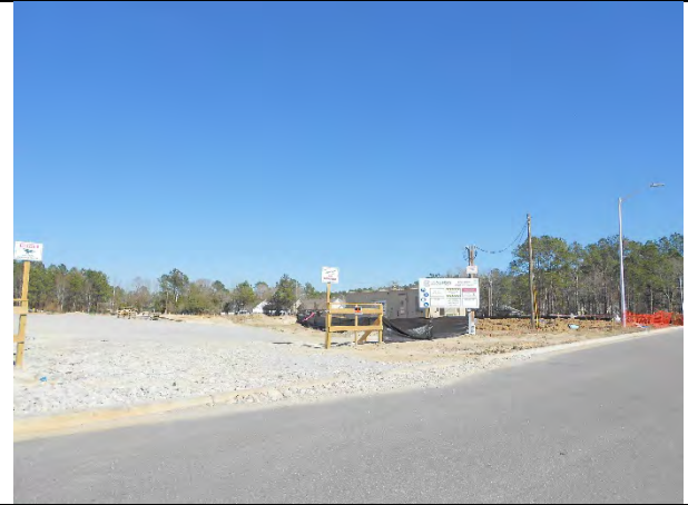
Commercial construction on US 17 at Persimmon Road (across from recently completed medical office park)