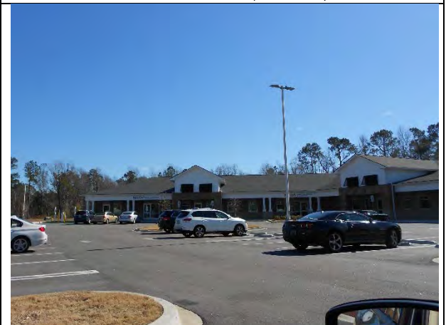
Recently completed medical office park on US 17 at Persimmon Road