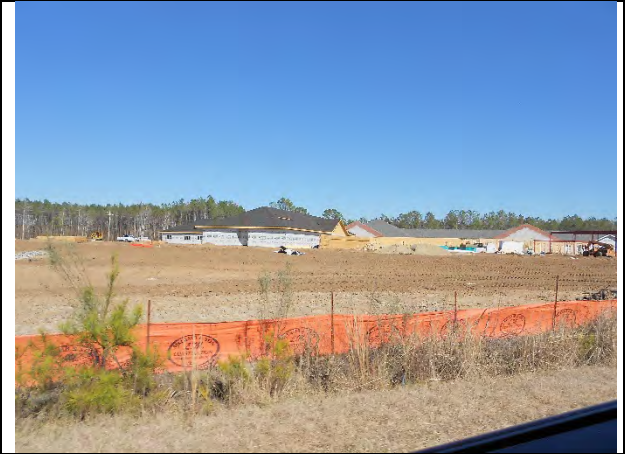
Brunswick Health & Rehab Center construction (Feb. 2017), northwest quadrant of Ash-Little River Road and No. 5 School Road intersection