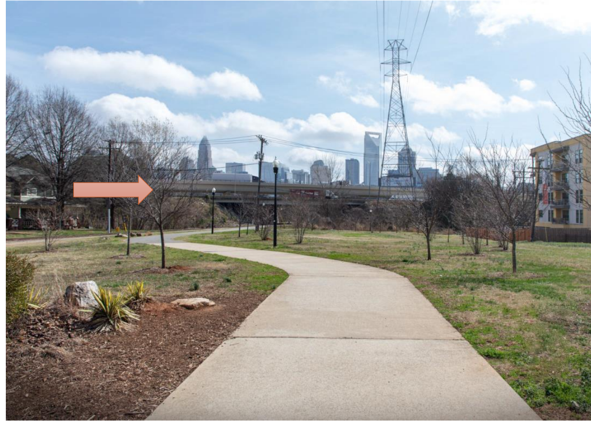
With Elevated Lanes