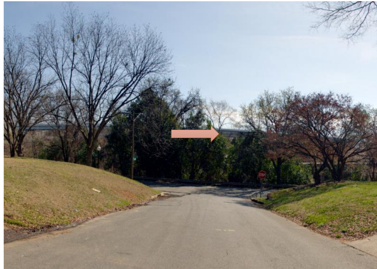
With Elevated Lanes