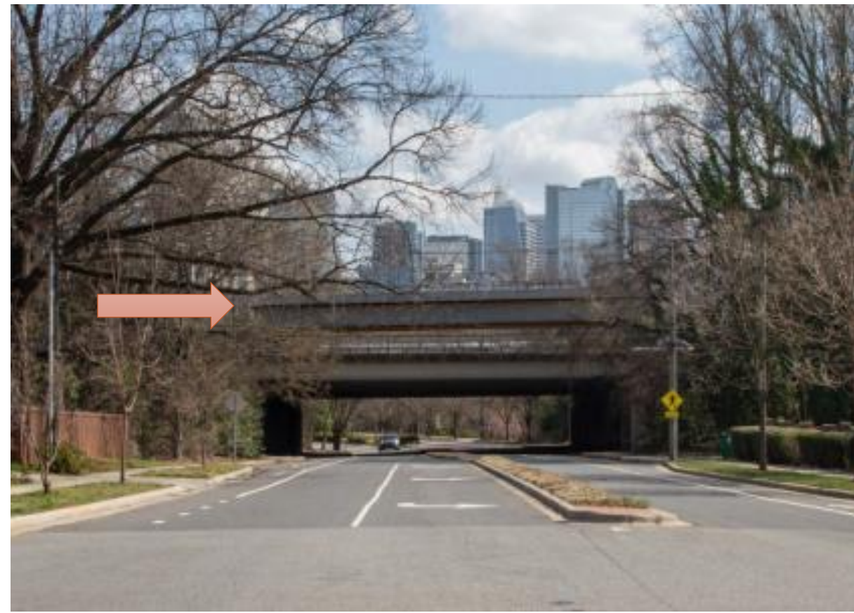
With Elevated Lanes