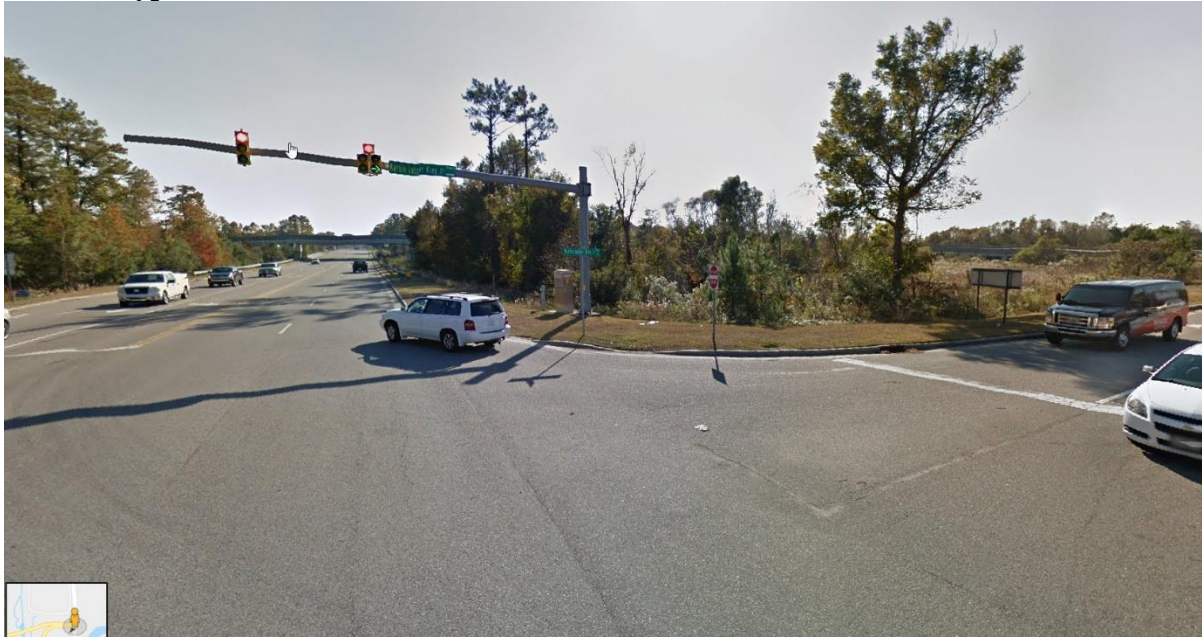
Photo from Google Street View

Facility ID: Pre-Regulated Landfill Incident Type/Number: N/A