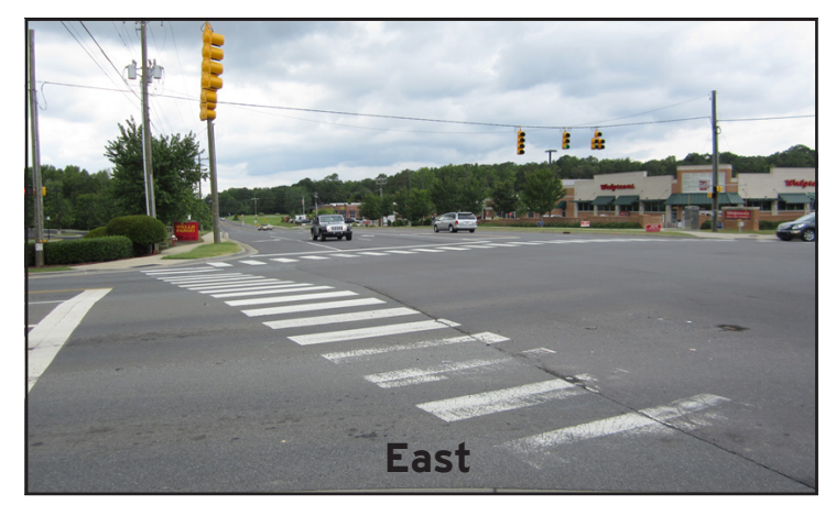
Weddington Road (NC 84) Indian Trail-Waxhaw Road (SR 1008)

NCDOT Mission Statement: Connecting people and places safely and efficiently, with accountability and environmental sensitivity to enhance the economy, health and well-being of North Carolina.