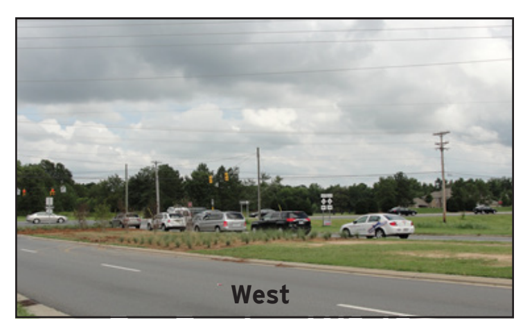
Rea Road (SR 1316) and Providence Road (NC 16)