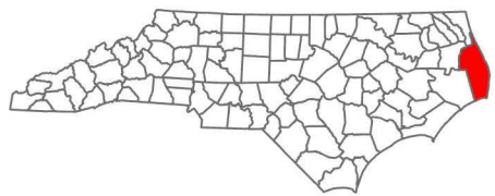
Figure 1. STIP Project HO-0027, RESCUER Study Area Map US 64 Wildlife Crossings Dare County